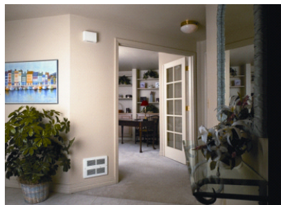
WHF Series Shown Above

Our new smart limit protectors do not only sense the outlet air conditioner, but also sense the intake air condition, providing complete control of the running condition of the heater in its environment. Either limit has the capability to trip and protect the consumer from overheat conditions. They are electrically turned off and can be reset by simply turning off the thermostat.